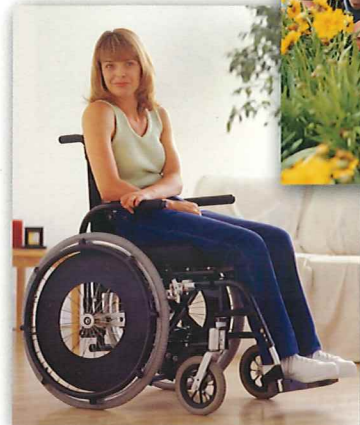
Bringing People and Resources Together